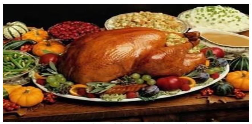
A turkey supper is planned for Saturday, October 20, 2018. It will be hosted by the Session. Save the date (tell your friends!)