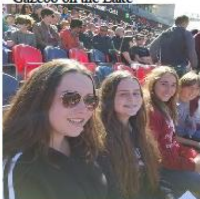
Ottawa Fury Soccer Game