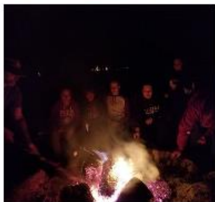
Evening Camp Fire