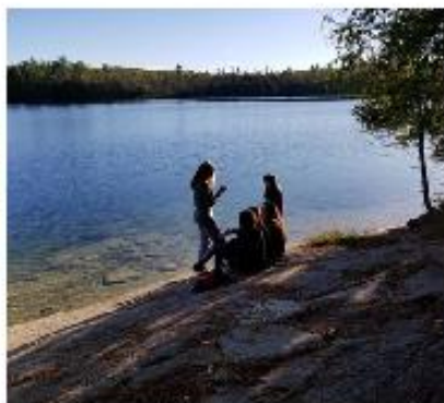
By the Lake