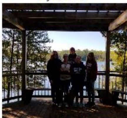
Gazebo on the Lake