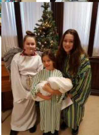
Pics from St. John's Christmas Pageant