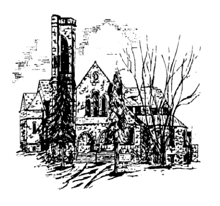
"Knowing, Enjoying and Sharing Christ's Love With All"